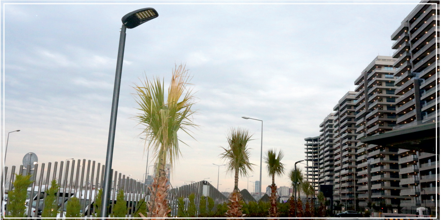
Hilton Hotel. Istanbul / Turkey

*CRI>70: Power Factor >95, Drive current 350 ma-1050ma